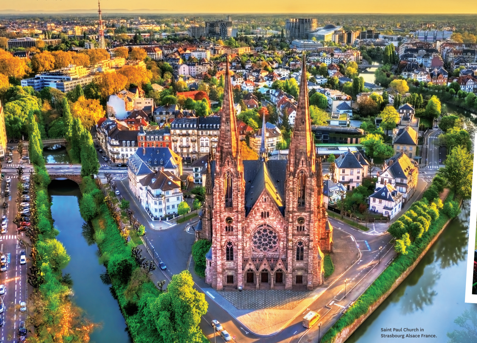
Saint Paul Church in Strasbourg Alsace France.